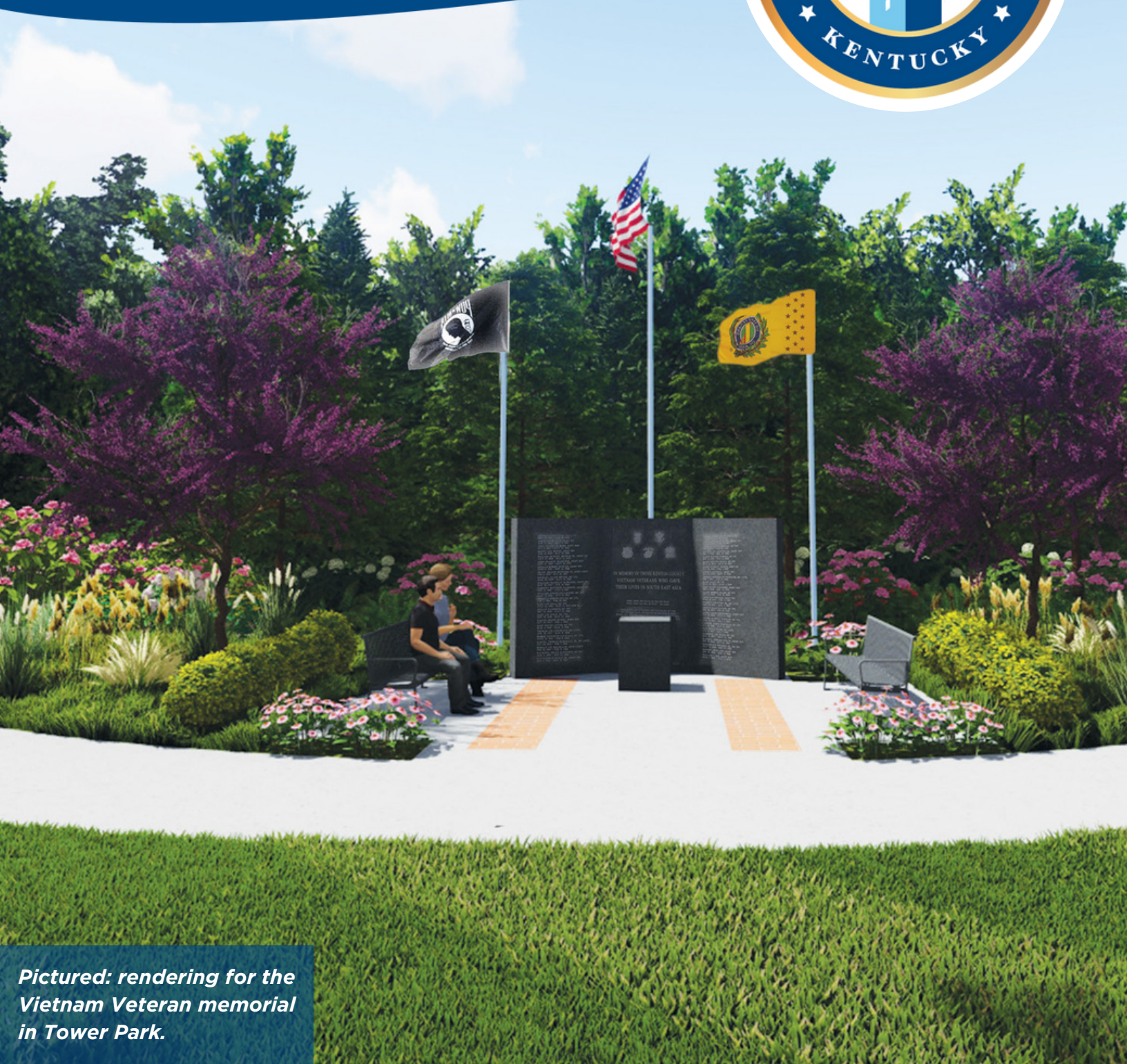
Pictured: rendering for the Vietnam Veteran memorial in Tower Park.