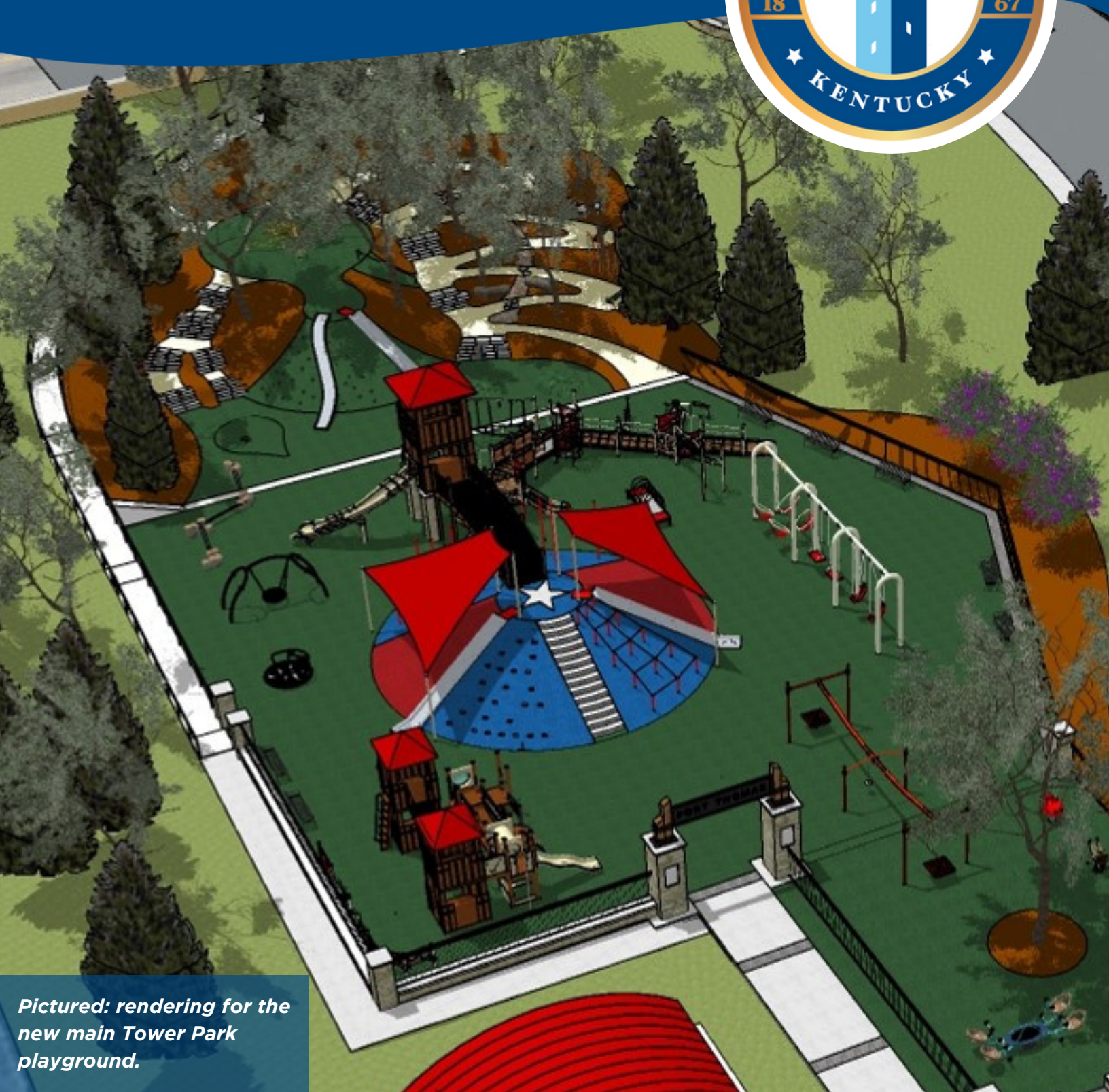
Pictured: rendering for the new main Tower Park playground.