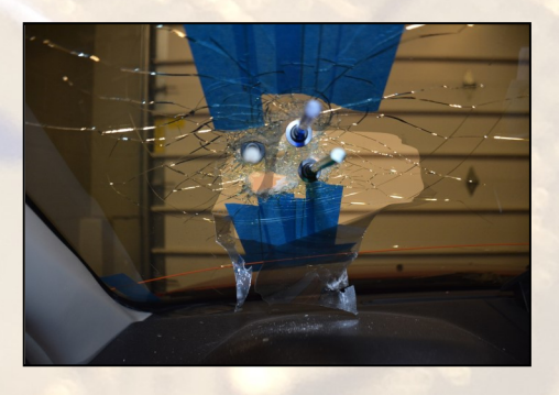
These are actual photos of the suspect's vehicle and grouping of the shots fired at our Officers who were directly in the line of fire.